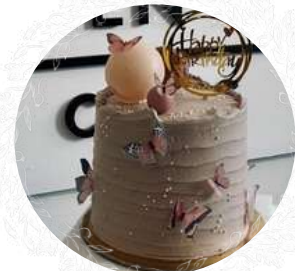
Queen City Cakes