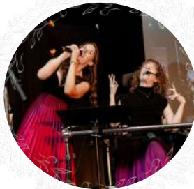
Listen To Dis